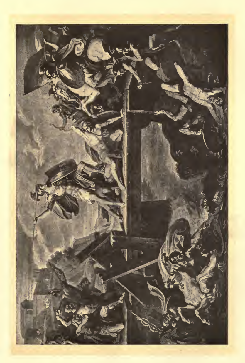
HORATIUS AT THE BRIDGE From a painting by Vincenzio Camucinni