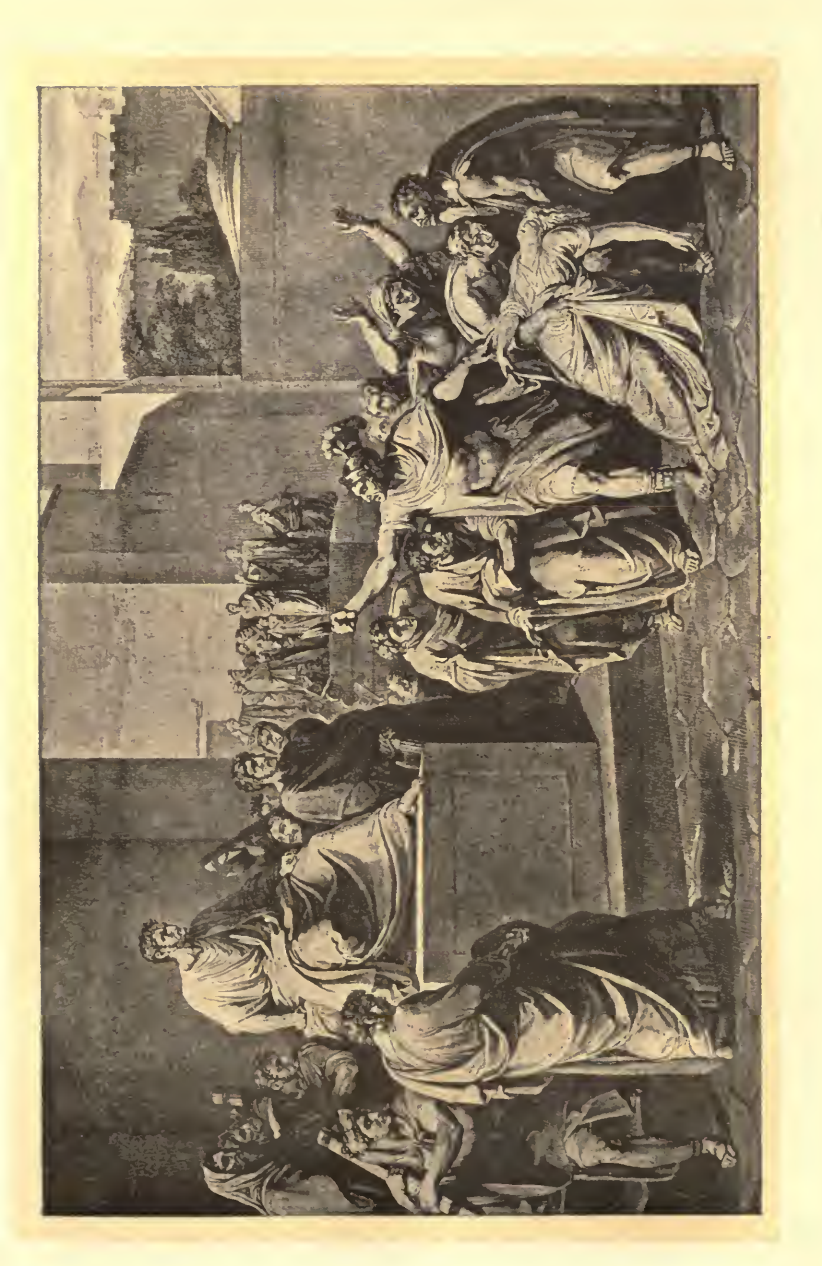
DEATH OF VIRGINIA From a painting by Vincenzio Camucinni